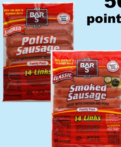
Bar S Smoked Sausage Regular or Polish 2.5 lb.