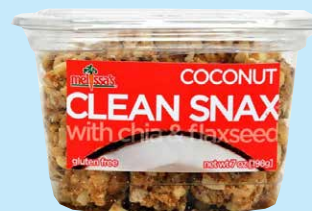
Clean Snax 6.5 oz. Select Varieties