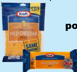
Kraft Chunk or Shredded Cheese Pre-Priced $3.29 8 oz. Select Varieties