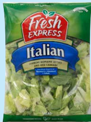
Fresh Express Italian, Veggie Lover's, Leafy Green Romaine, Field Greens or Sweet Butter 6-11 oz.