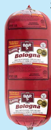
Bar S Bologna 5 lb. Chub

visit us online at: www.byersgeneral.com