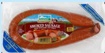
Farmland Smoked Sausage 14 oz.