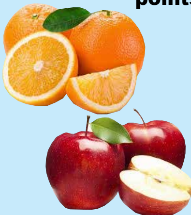
Bagged Apples or Oranges 3-4 lb.